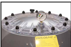
A Ø400 lid in reinforced PP for all models (available also in non-transparent version)