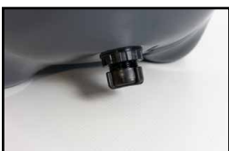
A larger filter drain of 1¼ for faster emptying